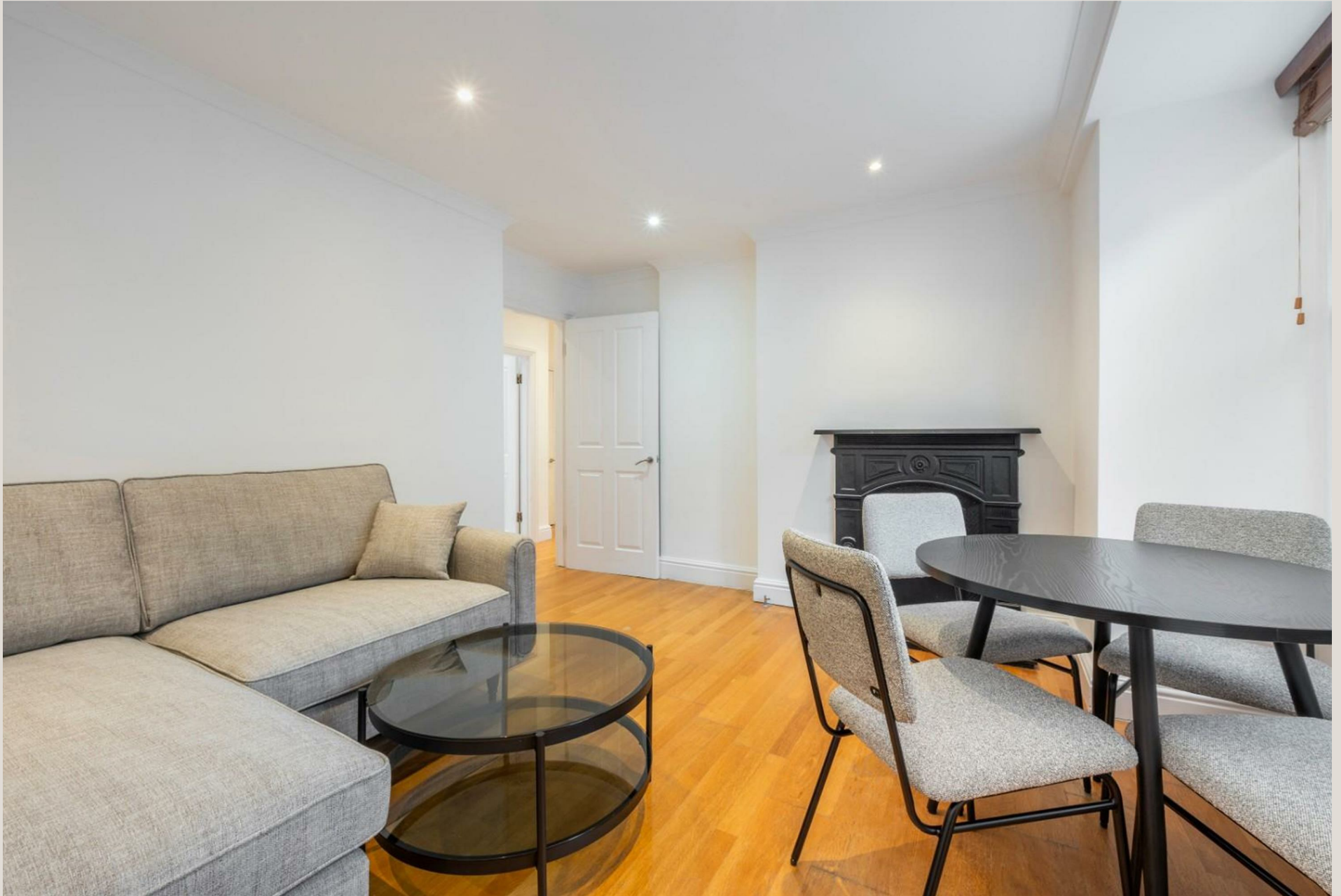
17 New North Street