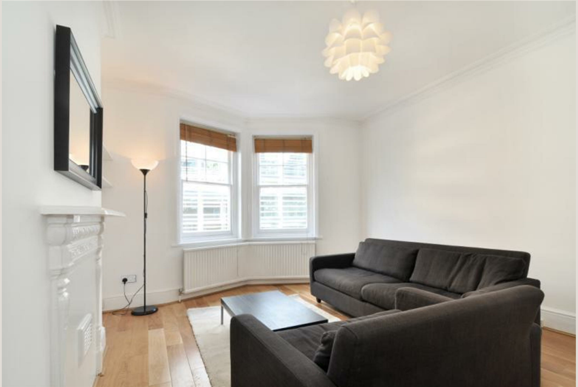
Great Titchfield Street