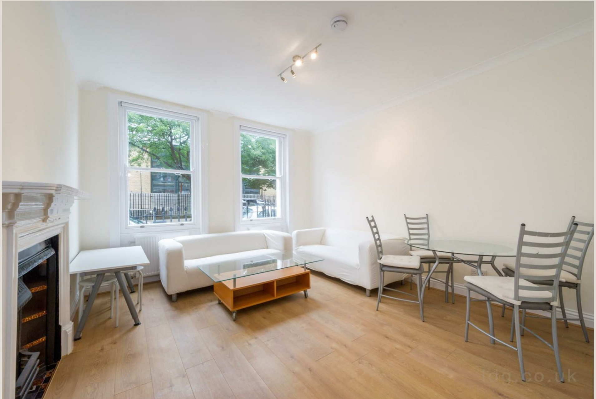
6 Cosway Street