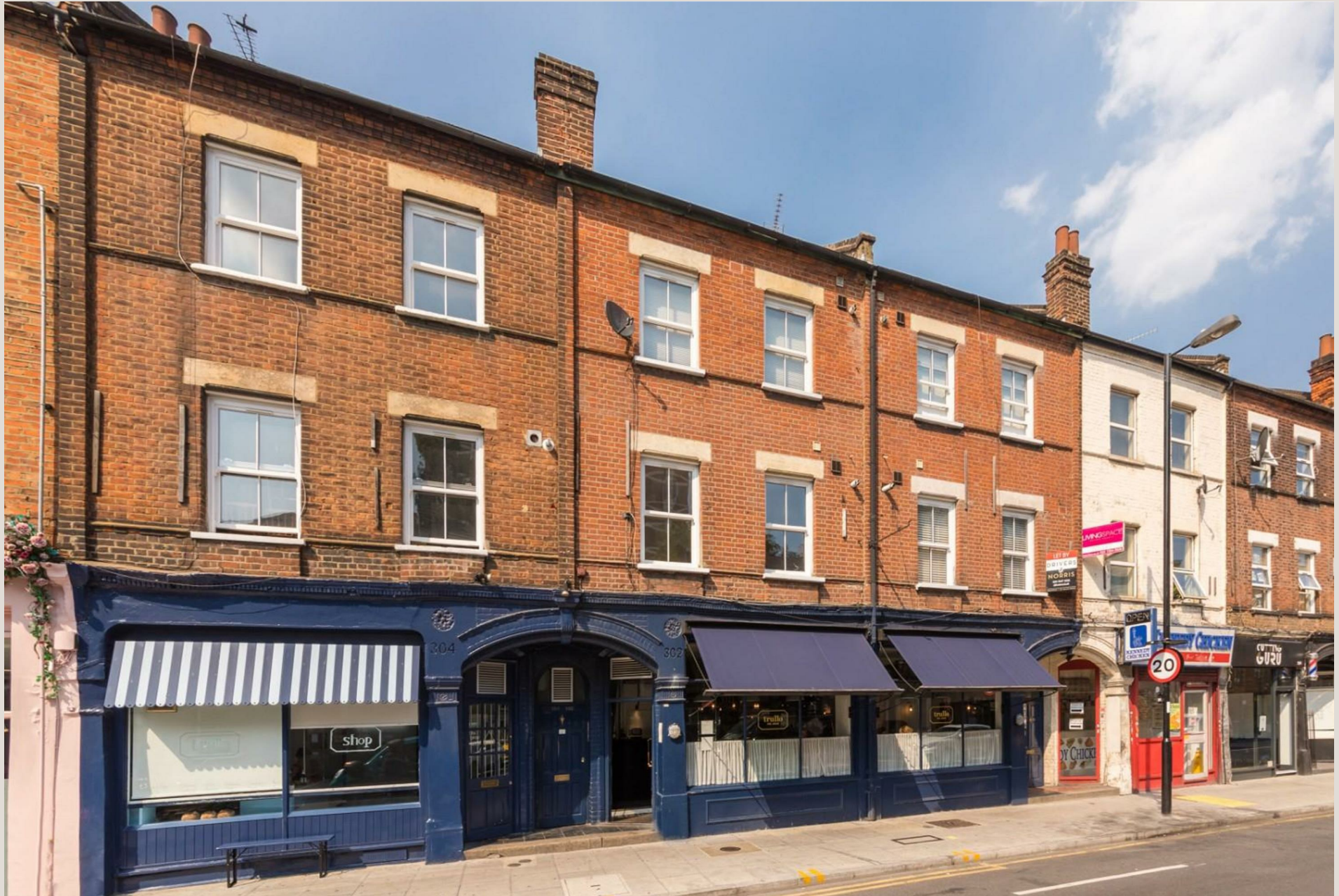
St. Pauls Road