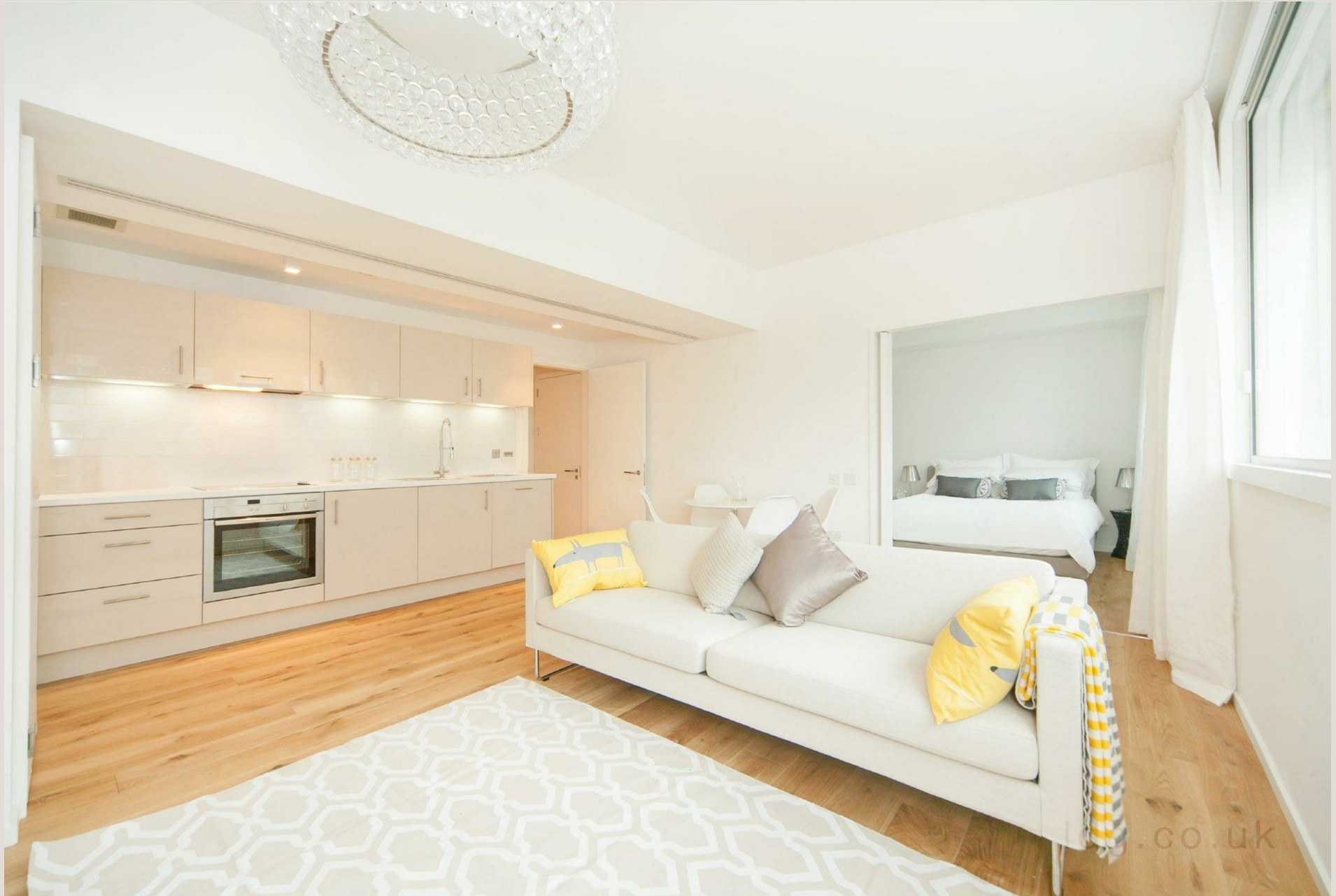
7-8 Rathbone Place