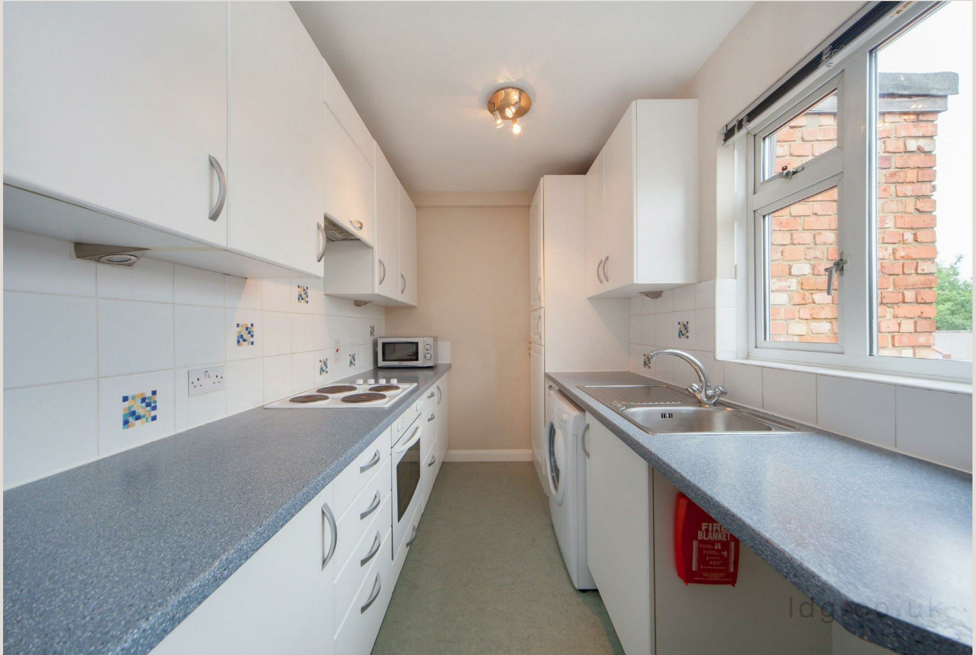
131-133 Cleveland Street