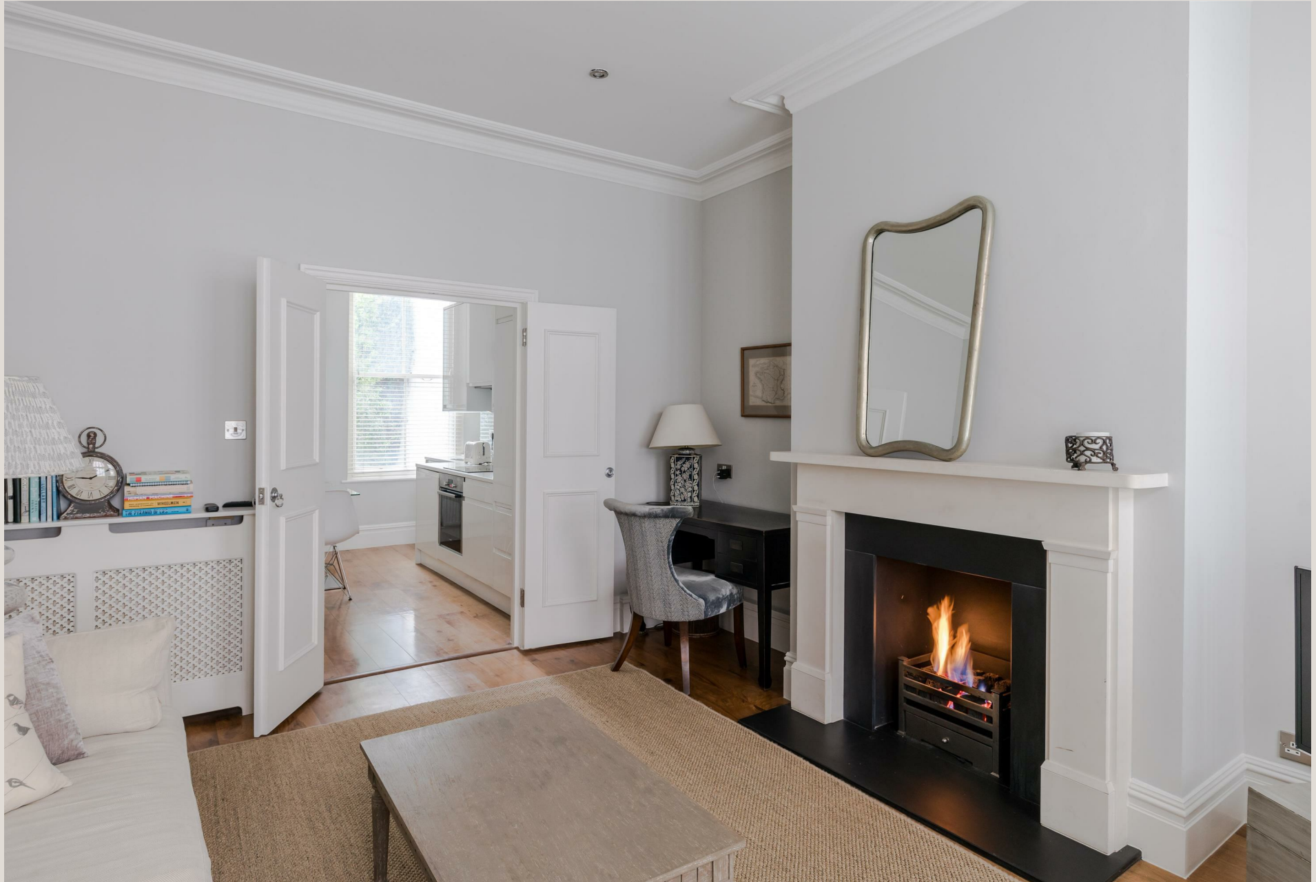
Great Titchfield Street