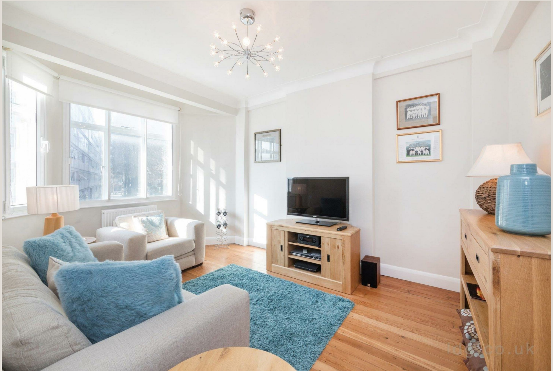
86-90 Cleveland Street