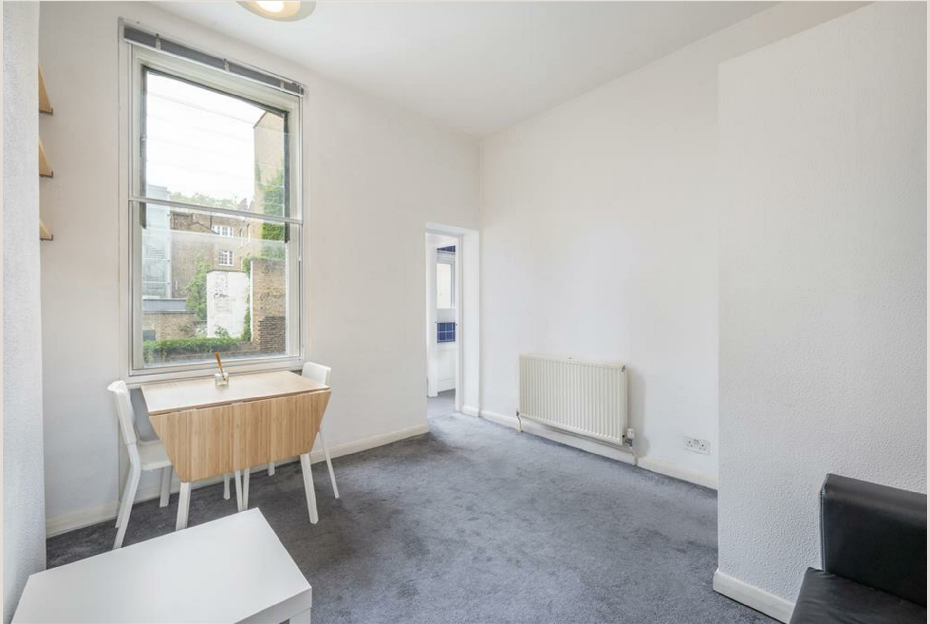
32 Maple Street