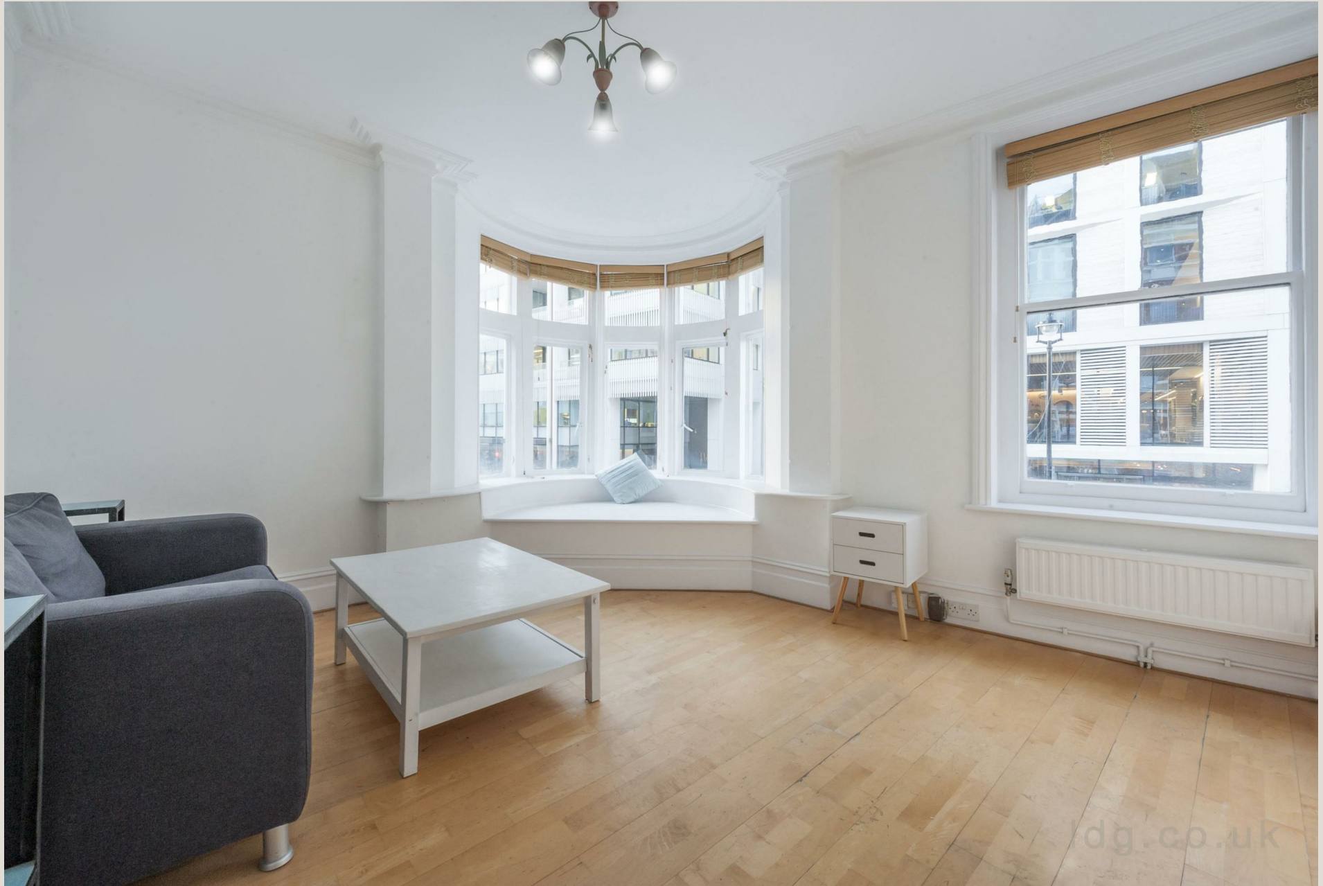
34-36 Berners Street