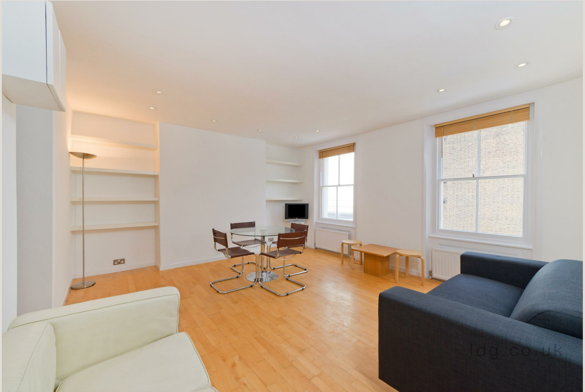
51 Cleveland Street