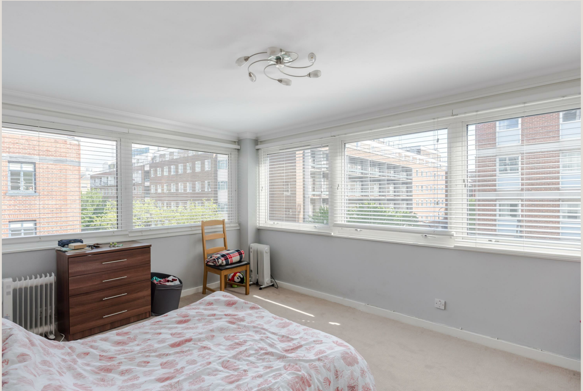
19-23 Fitzroy Street