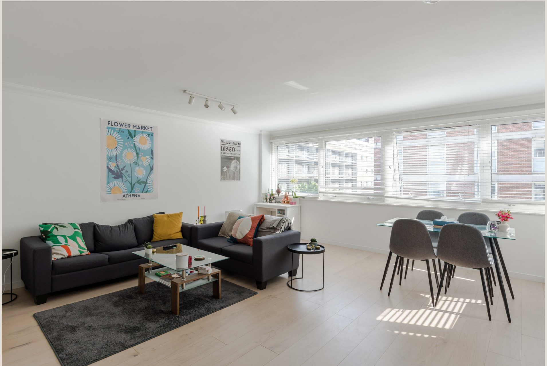
19-23 Fitzroy Street