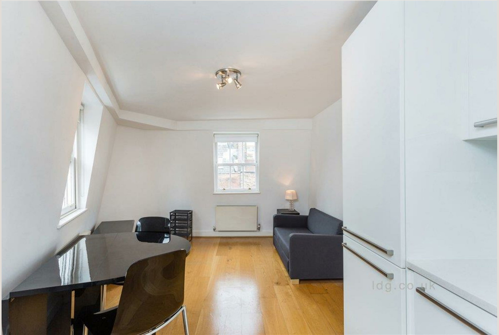
30 Tavistock Street