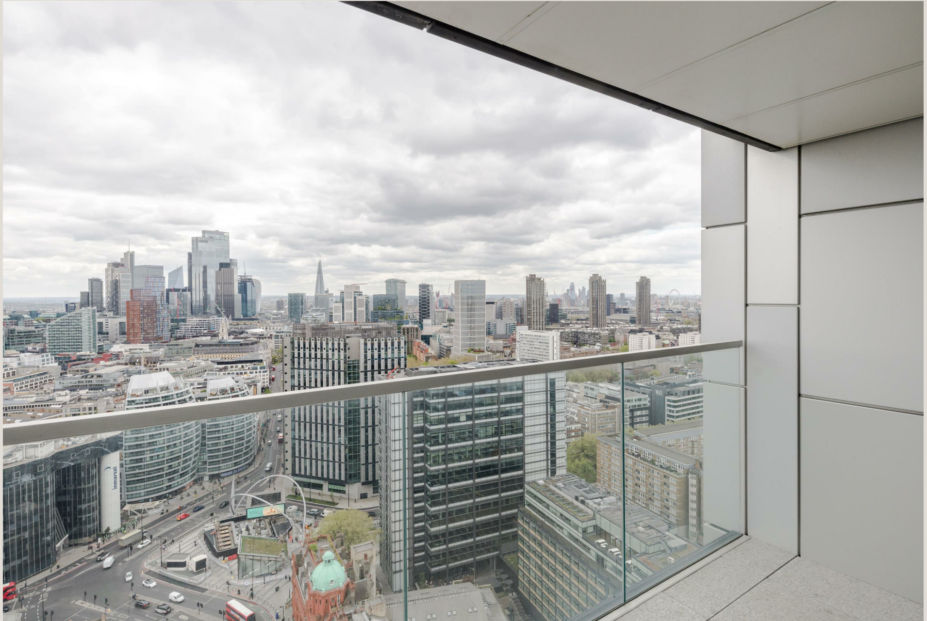
145 City Road