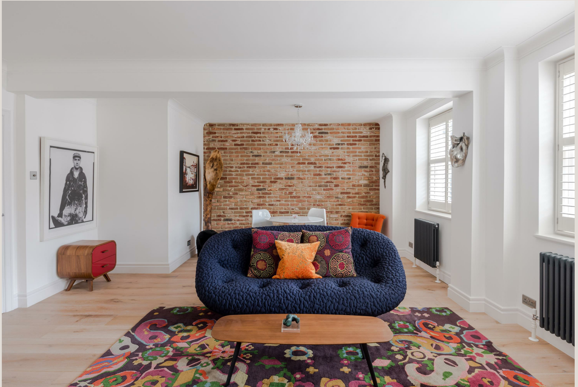
7 Weymouth Mews