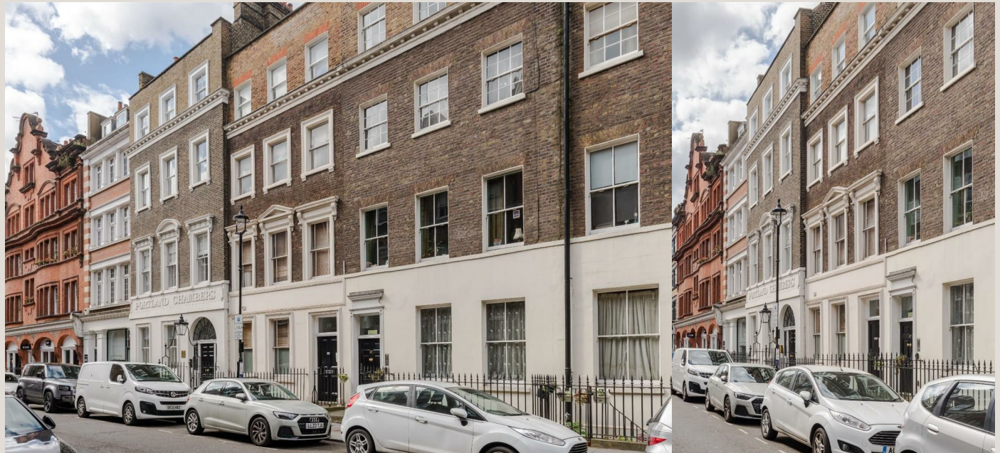
Great Titchfield Street