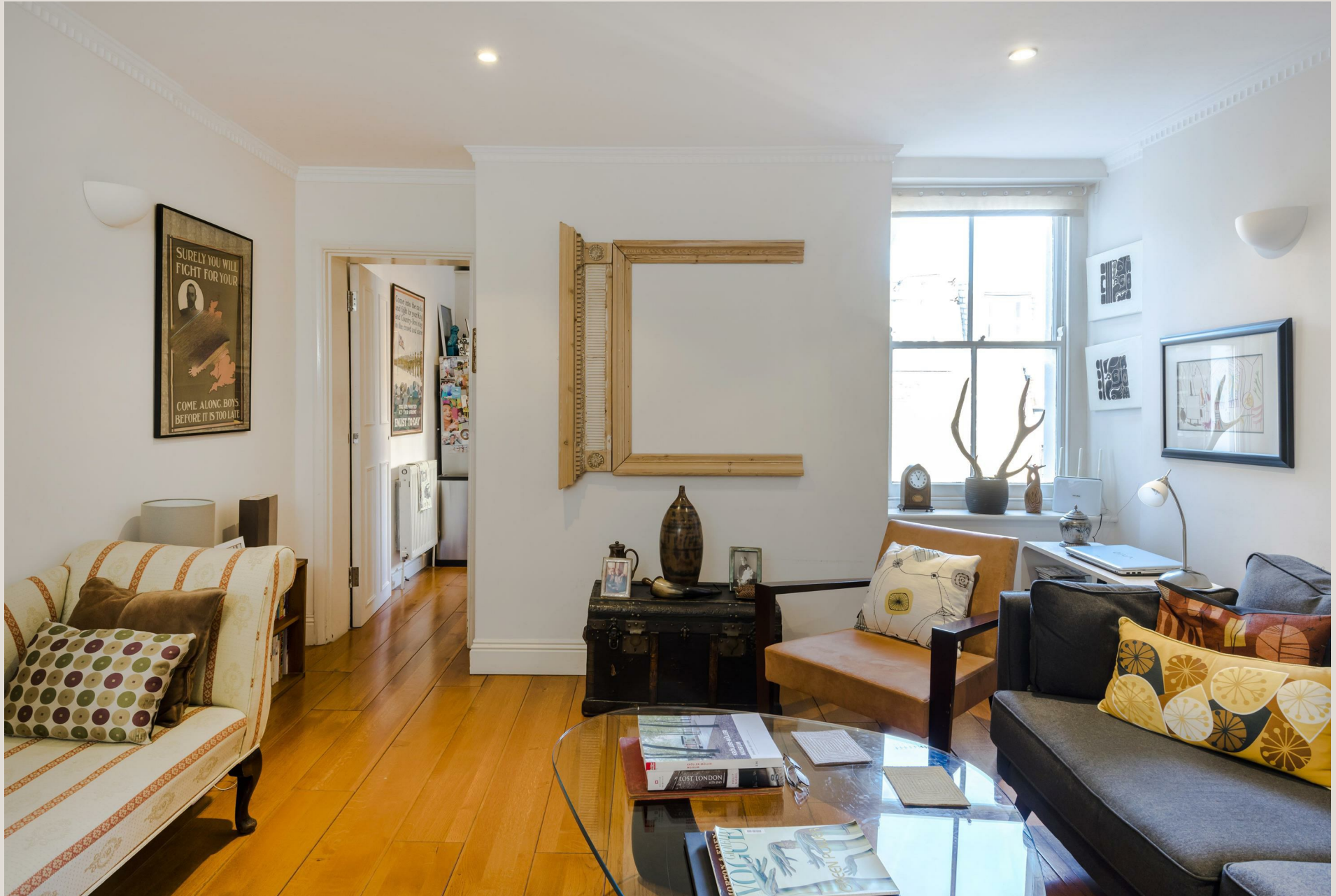
Great Titchfield Street