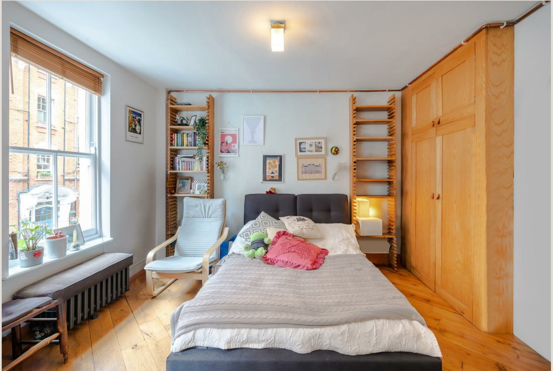
20 Hanson Street