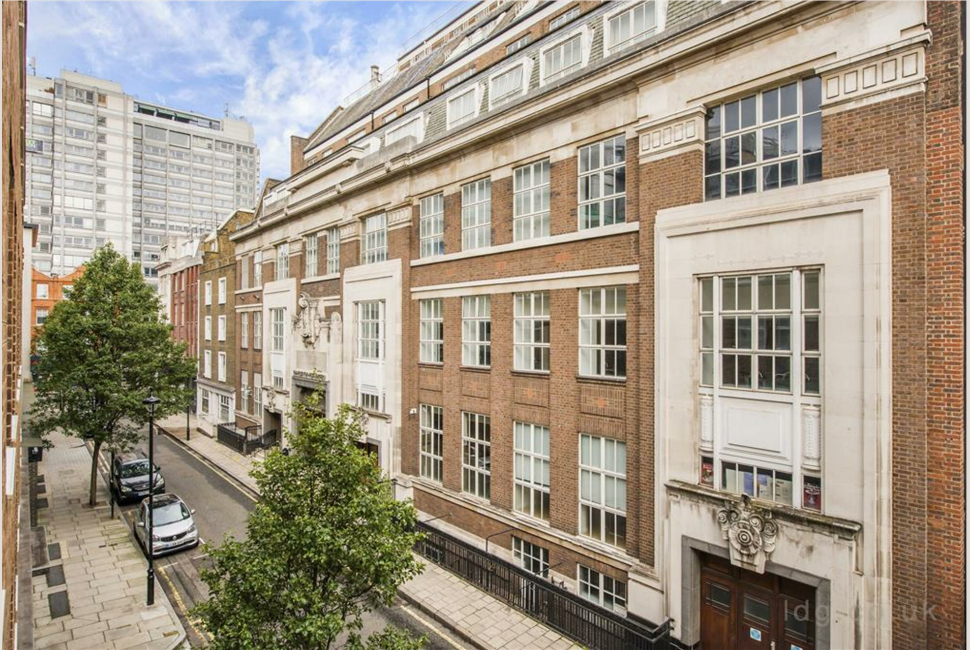
1-3 Little Titchfield Street