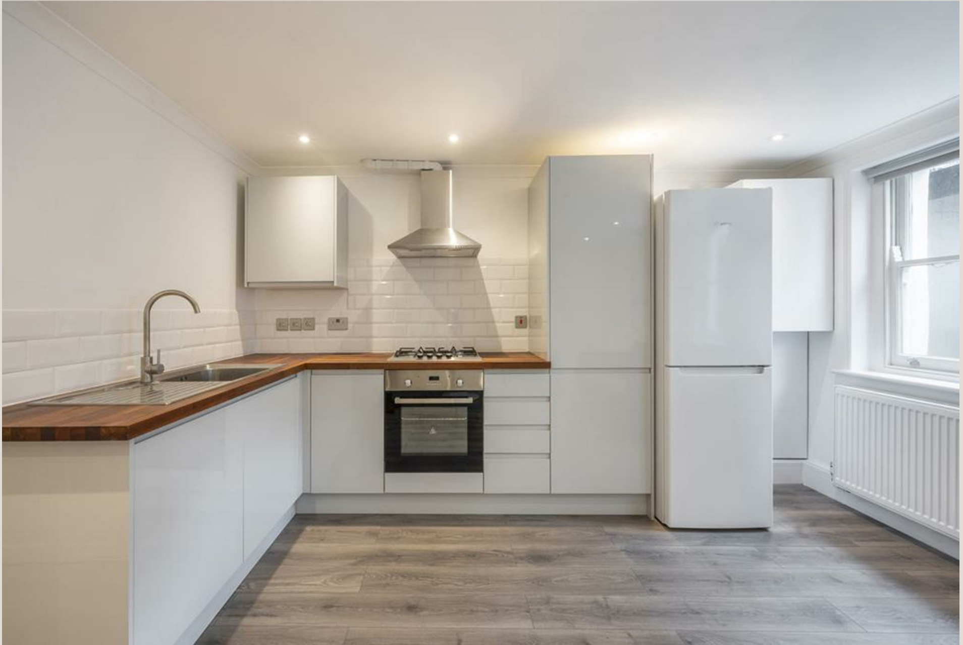
6 Cosway Street