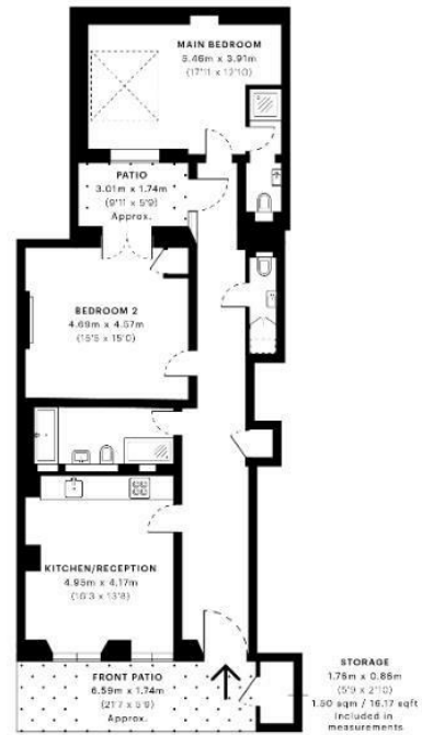
— Lower Ground Floor