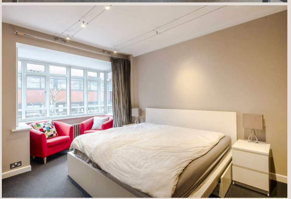
38-39 University Street