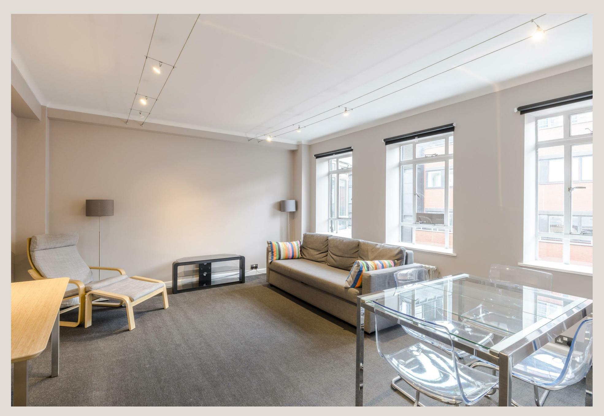
38-39 University Street