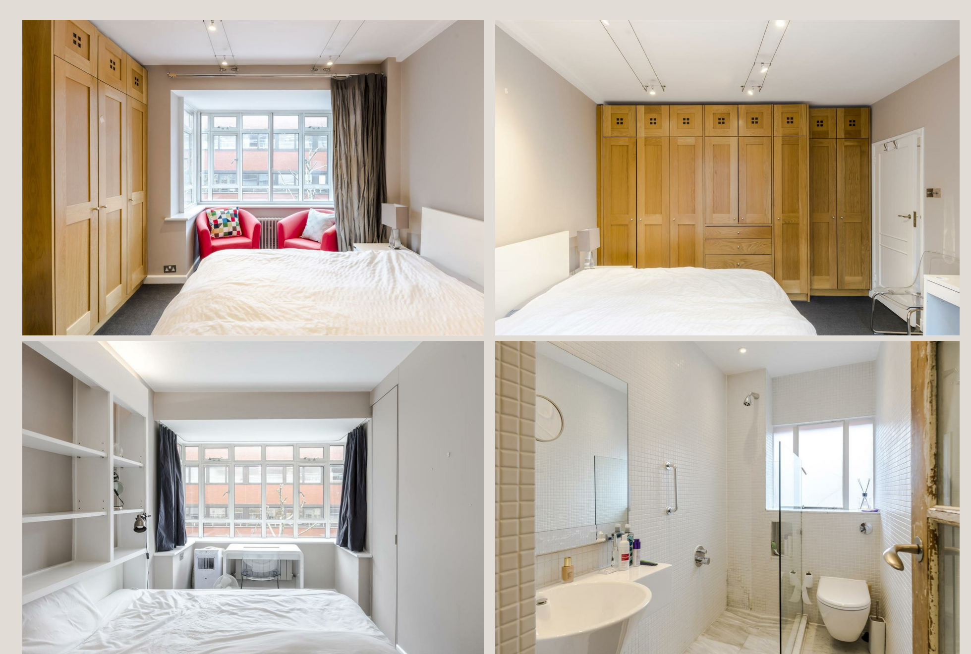
38-39 University Street