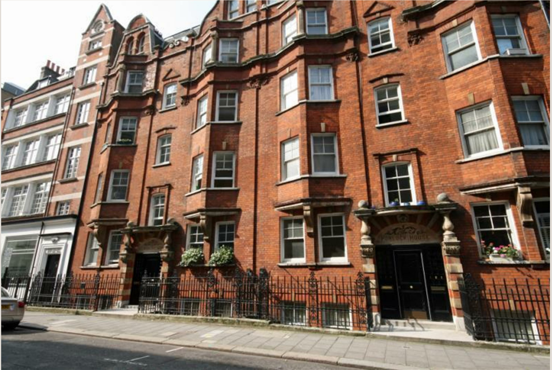
Great Titchfield Street