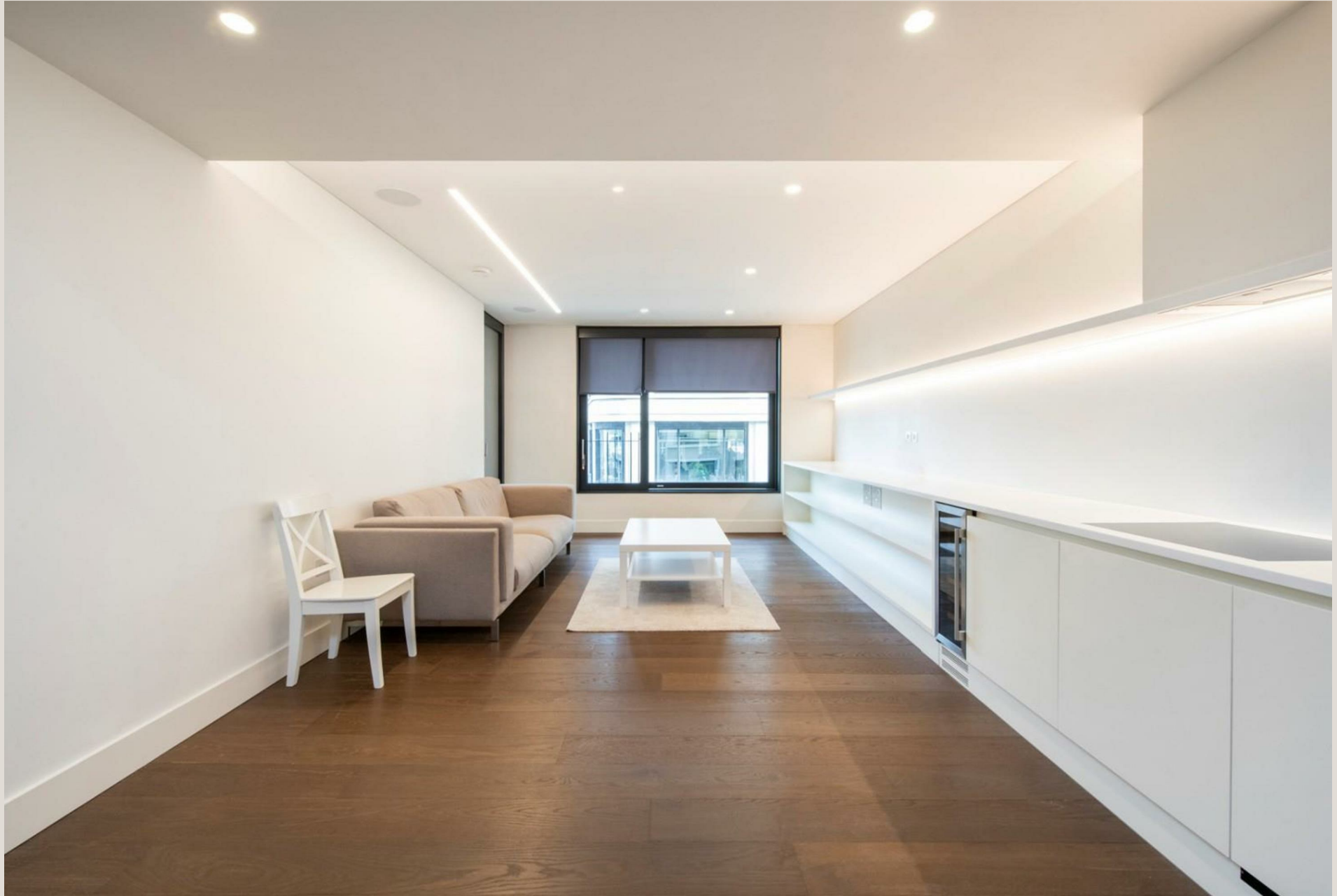
37 Rathbone Place