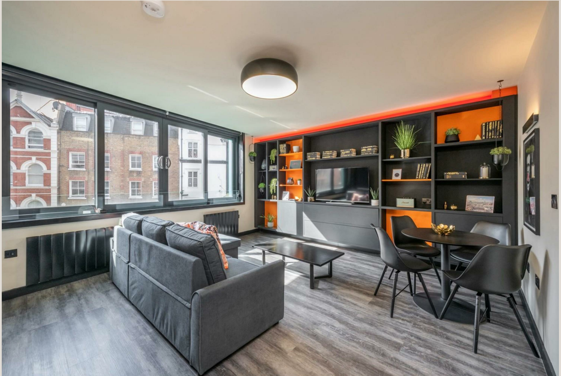
Old Compton Street