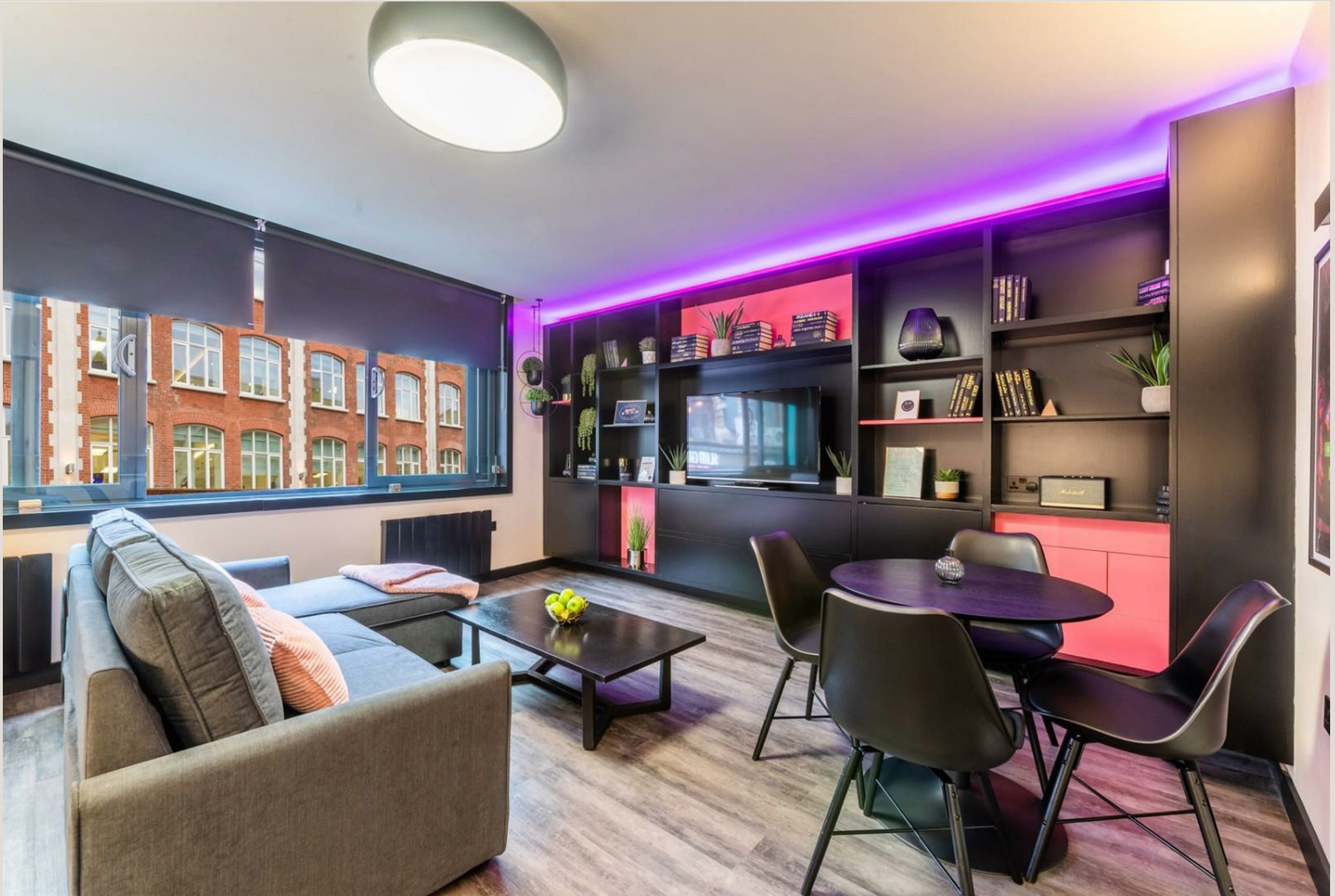
18a Old Compton Street