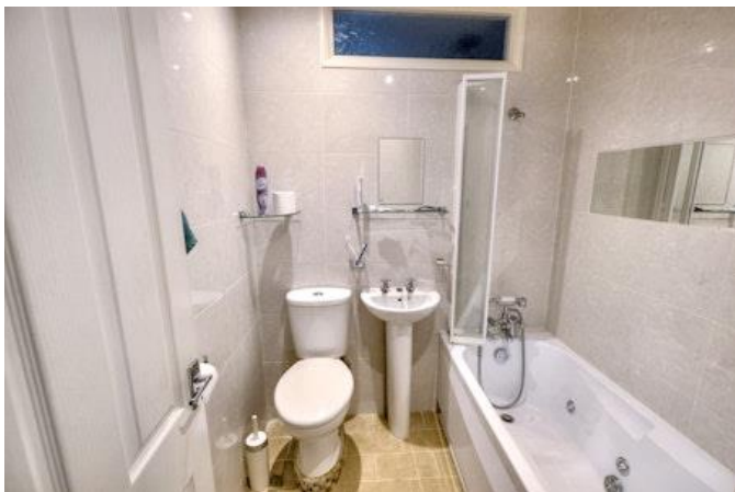
En- Suite 1.52m x 0.89m (5'0" x 2'11")