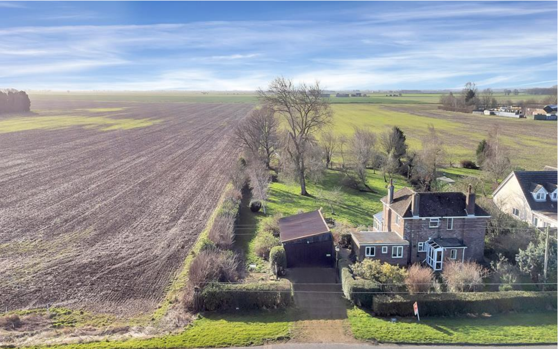
Briar House Dowsby Fen, Dowsby, Bourne, PE10 0TU