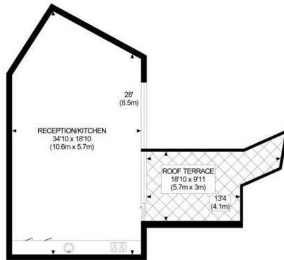
FIRST FLOOR GROSS INTERNAL FLOOR AREA 572 SQ FT