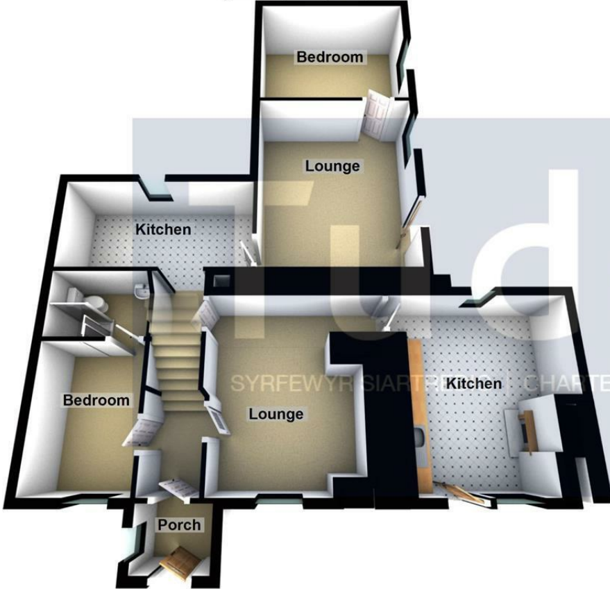
Ground Floor Approx. 81.7 sq. metres (879.9 sq. feet)