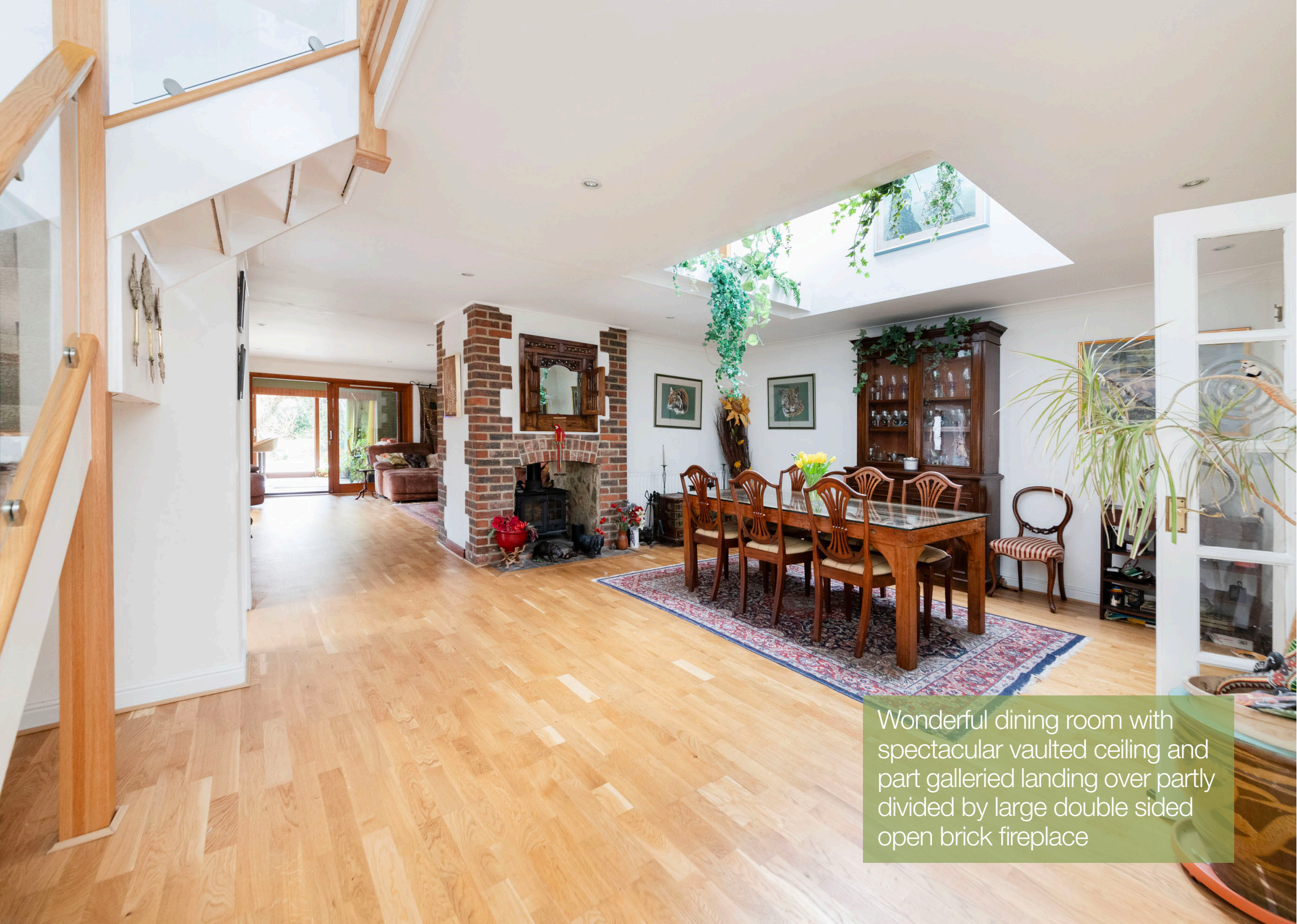
Wonderful dining room with spectacular vaulted ceiling and part galleried landing over partly divided by large double sided open brick fireplace