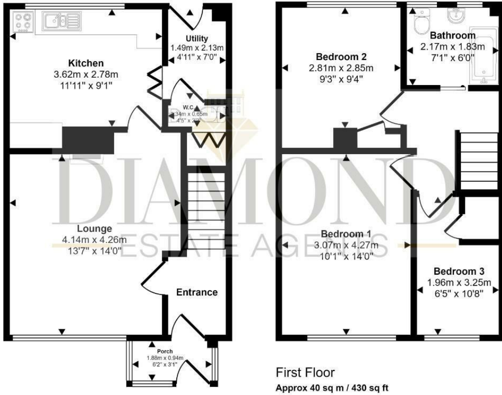
Ground Floor Approx 42 sq m / 457 sq ft

Approx Gross Internal Area 82 sq m / 887 sq ft