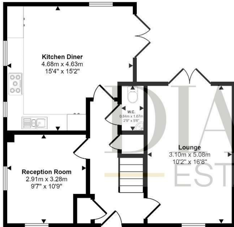
Ground Floor Approx 56 sq m / 604 sq ft

Approx Gross Internal Area 132 sq m / 1419 sq ft