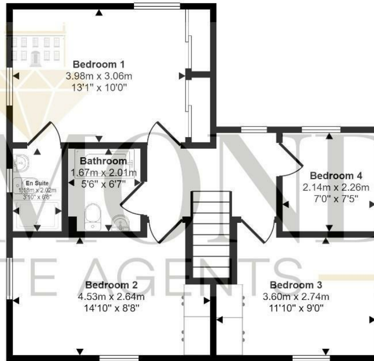
First Floor Approx 56 sq m / 601 sq ft