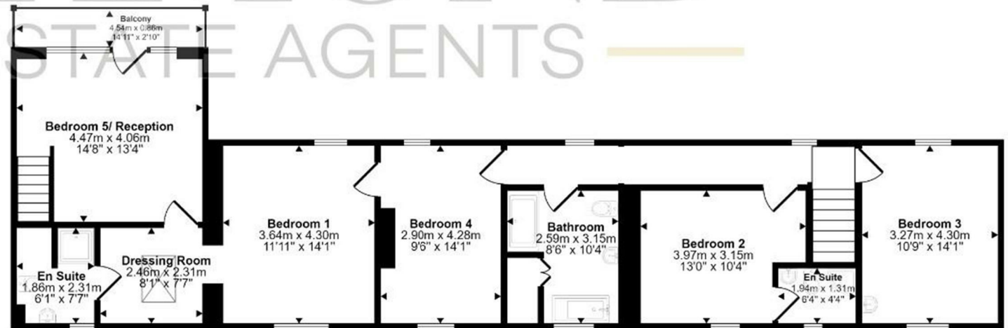
First Floor Approx 112 sq m / 1201 sq ft

This floorplan is only for illustrative purposes and is not to scale. Measurements of rooms, doors, windows, and any items are approximate and no responsibility is taken for any error, omission or mis-statement. Icons of items such as bathroom suites are representations only and may not look like the real items. Made with Made Snappy 360.