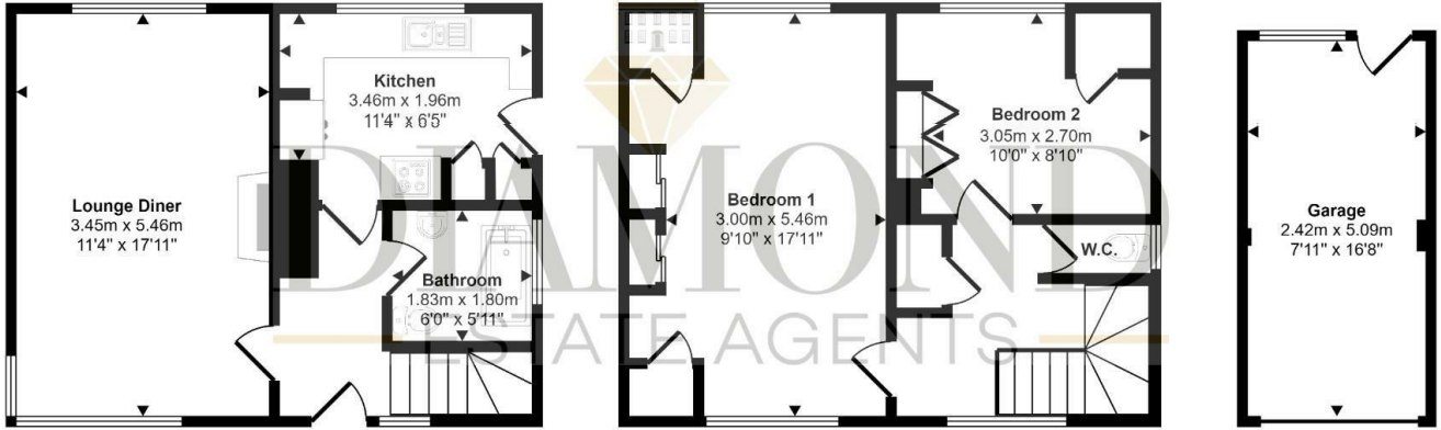
Ground Floor Approx 39 sq m / 415 sq ft

Approx Gross Internal Area 90 sq m / 969 sq ft