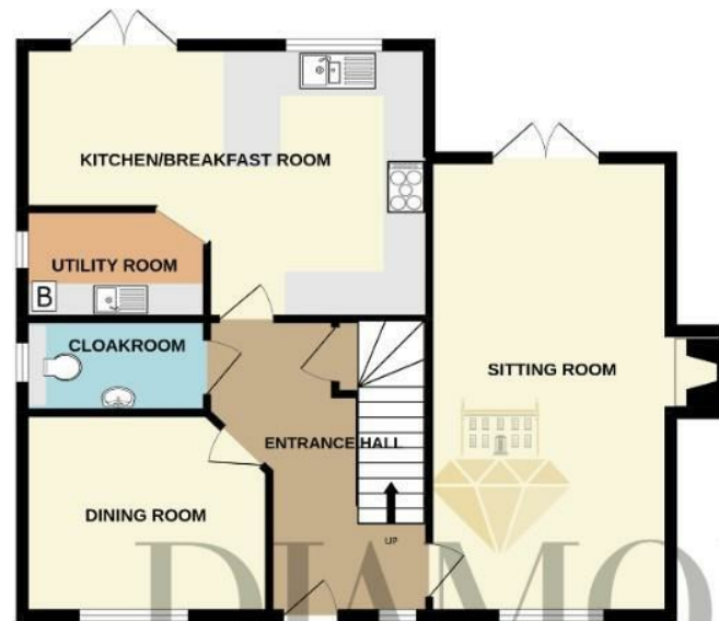
GROUND FLOOR 1065 sq.ft. (99.0 sq.m.) approx.