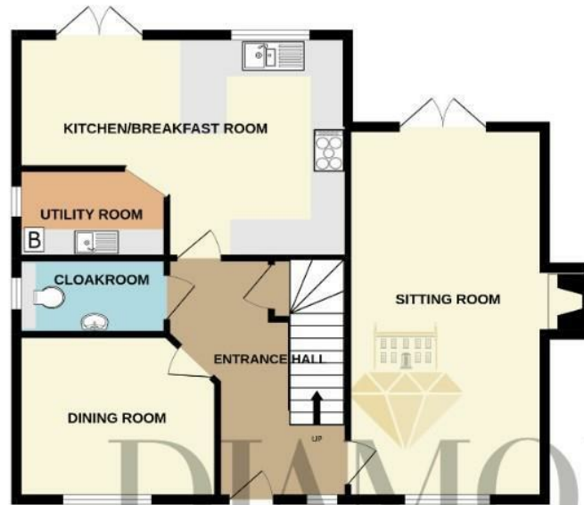
GROUND FLOOR 1065 sq.ft. (99.0 sq.m.) approx.