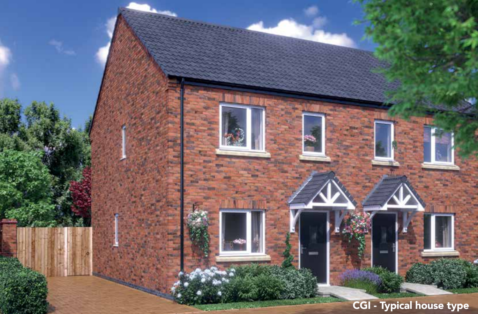
CGI - Typical house type