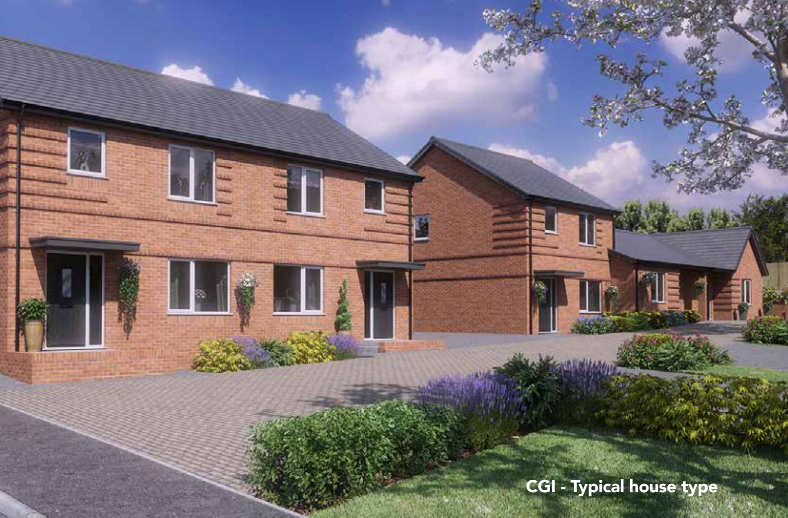
CGI - Typical house type