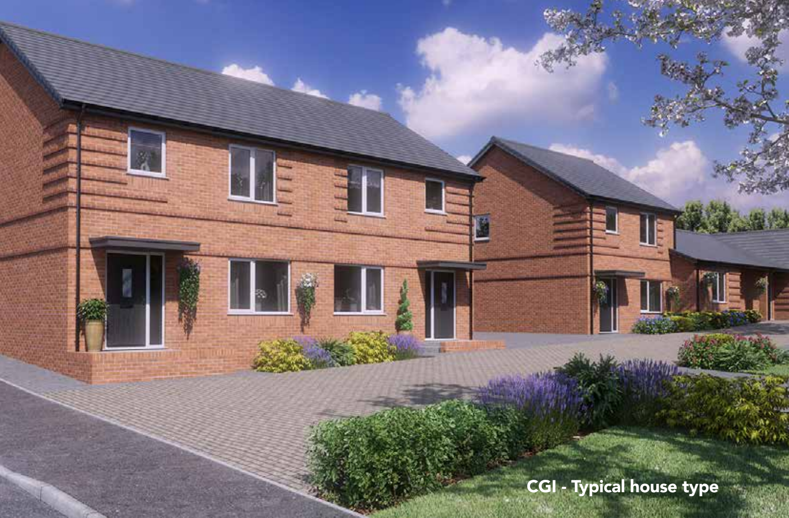
CGI - Typical house type