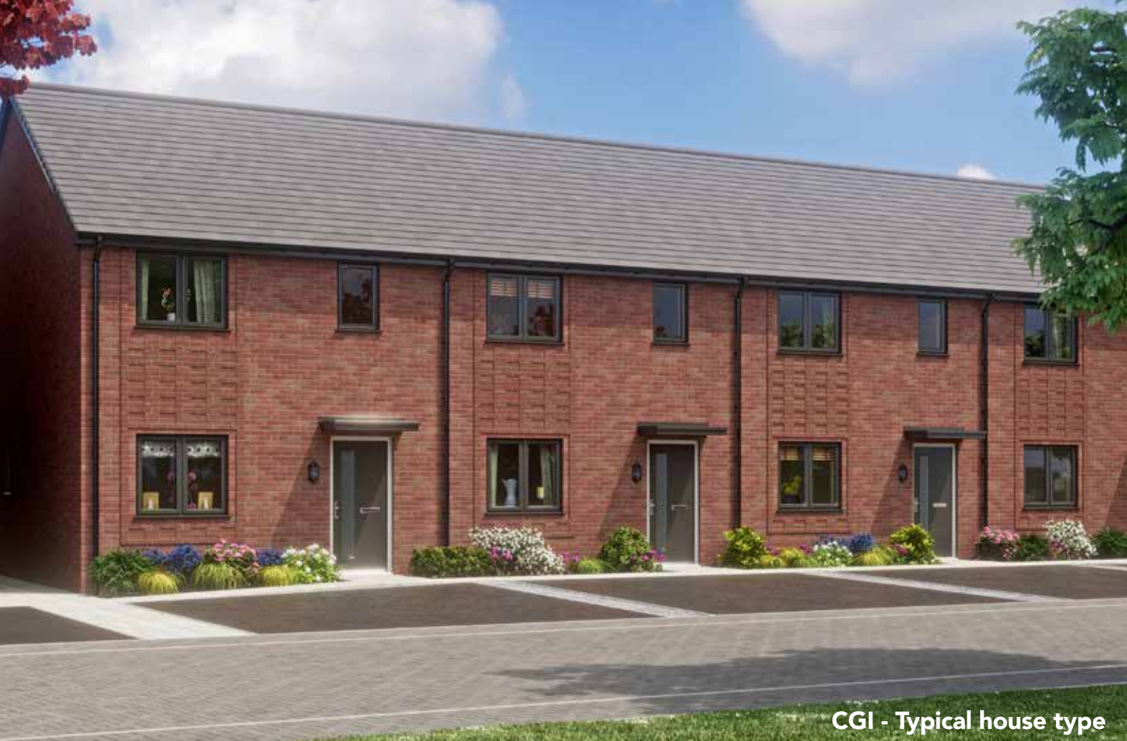
CGI - Typical house type