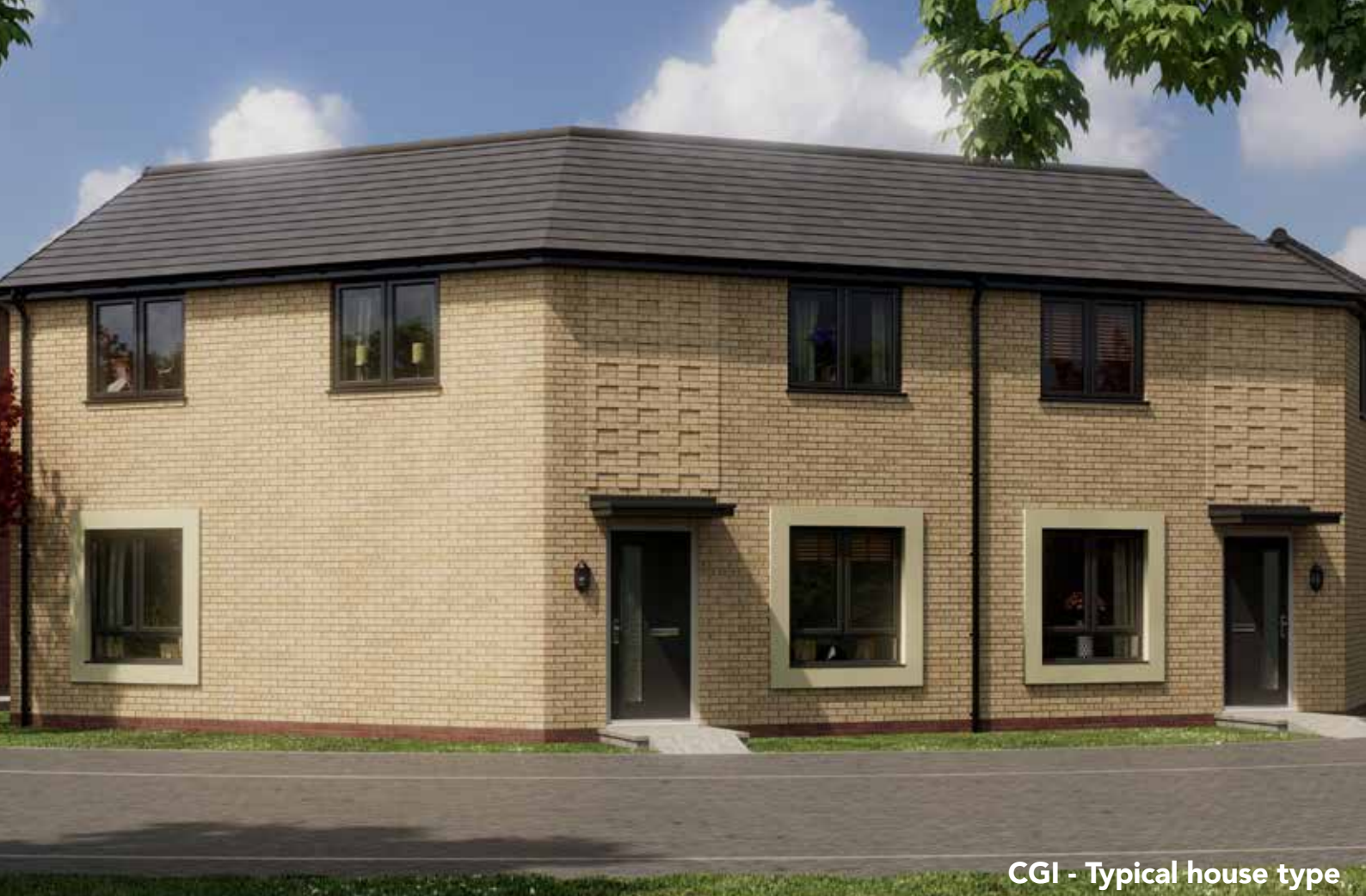
CGI - Typical house type