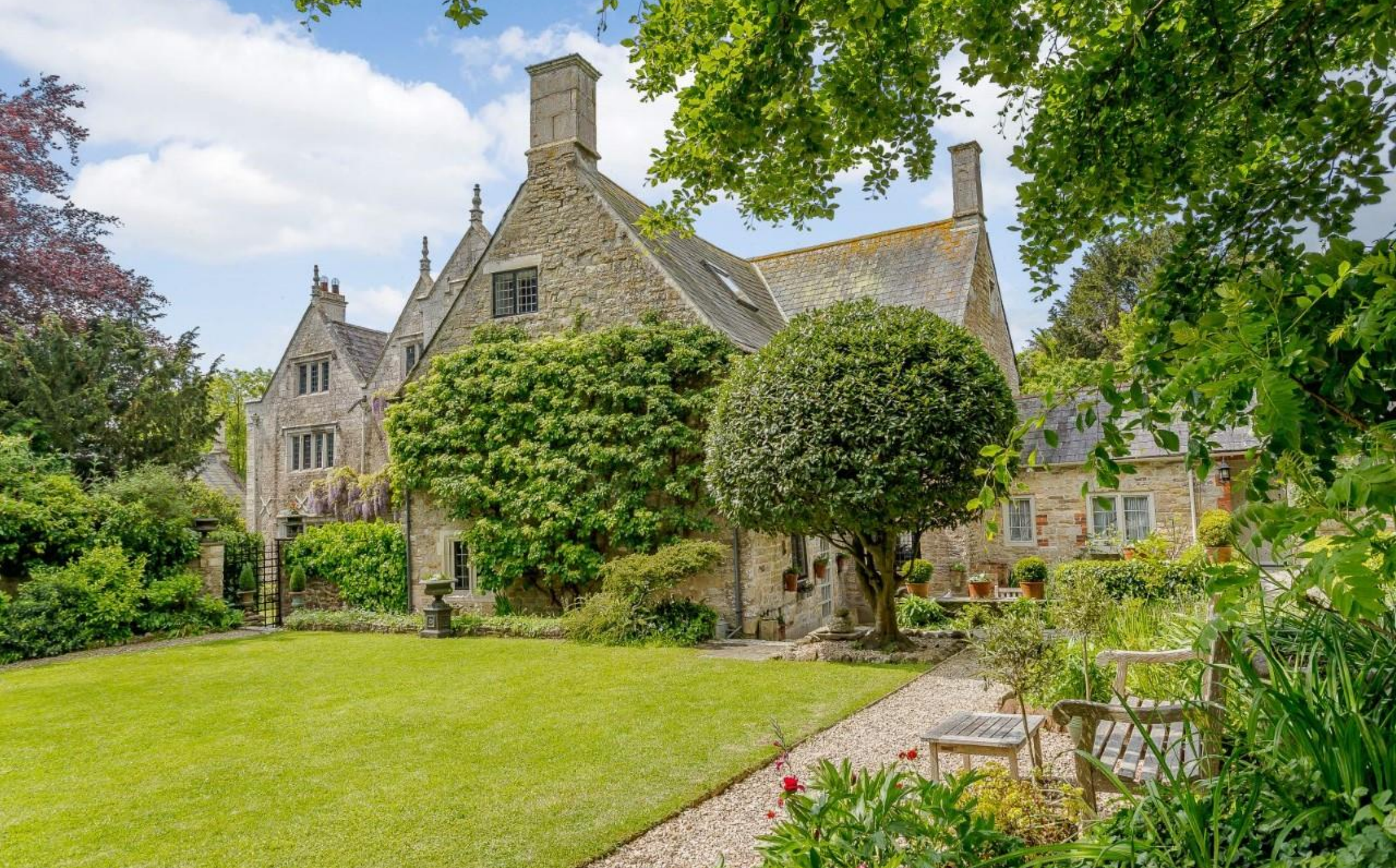
The Old Manor House Radipole, Weymouth, Dorset, DT3 5HS