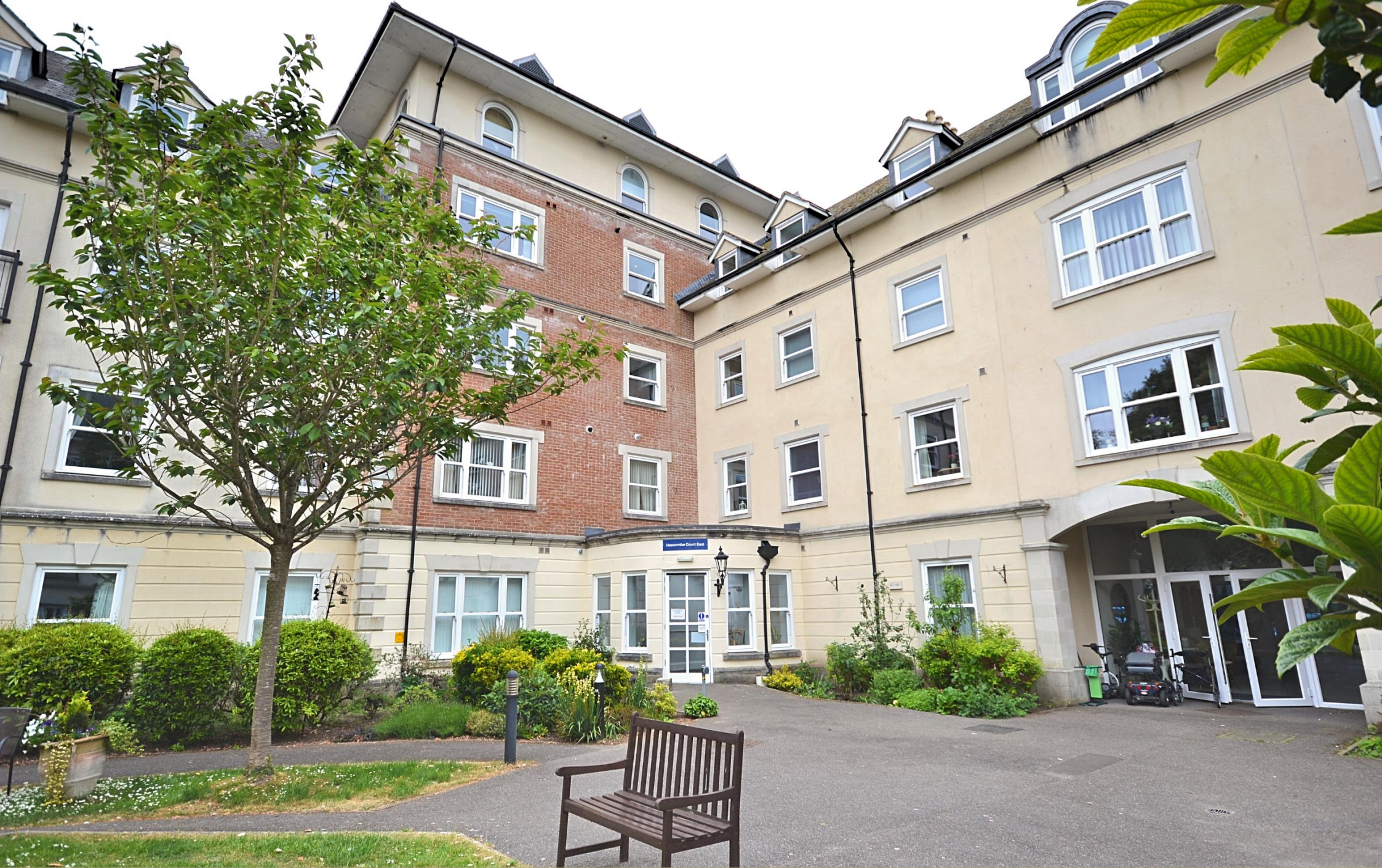
Hascombe Court Dorchester