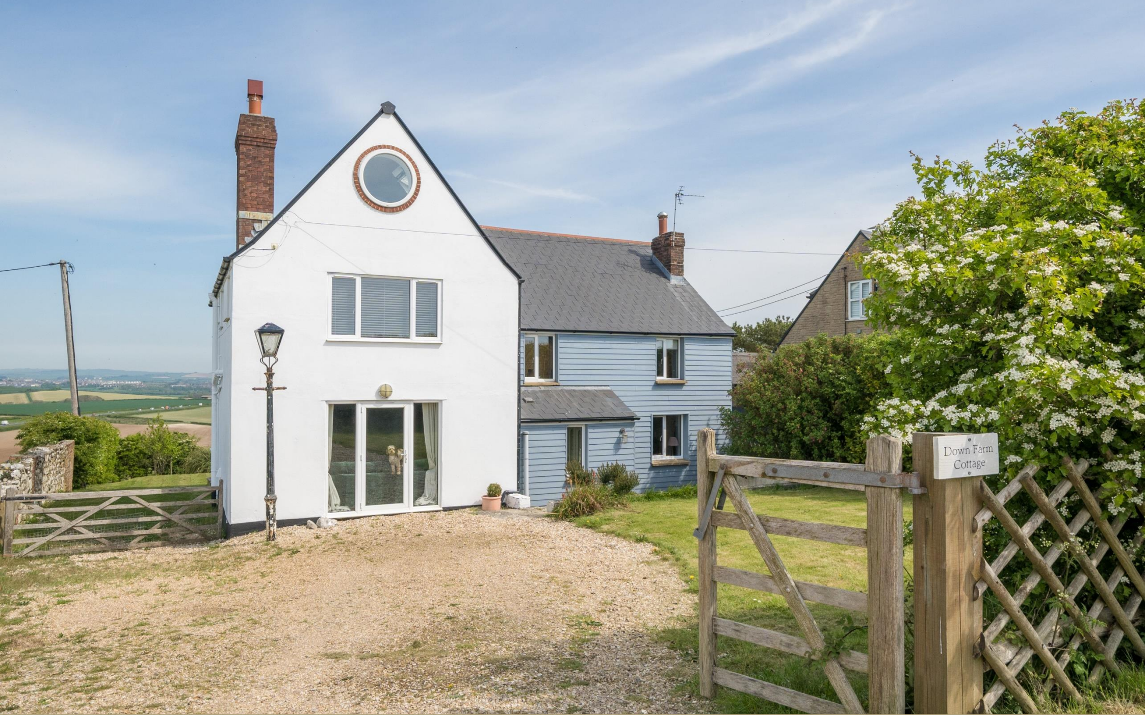
Down Farm Cottage Bincombe Down