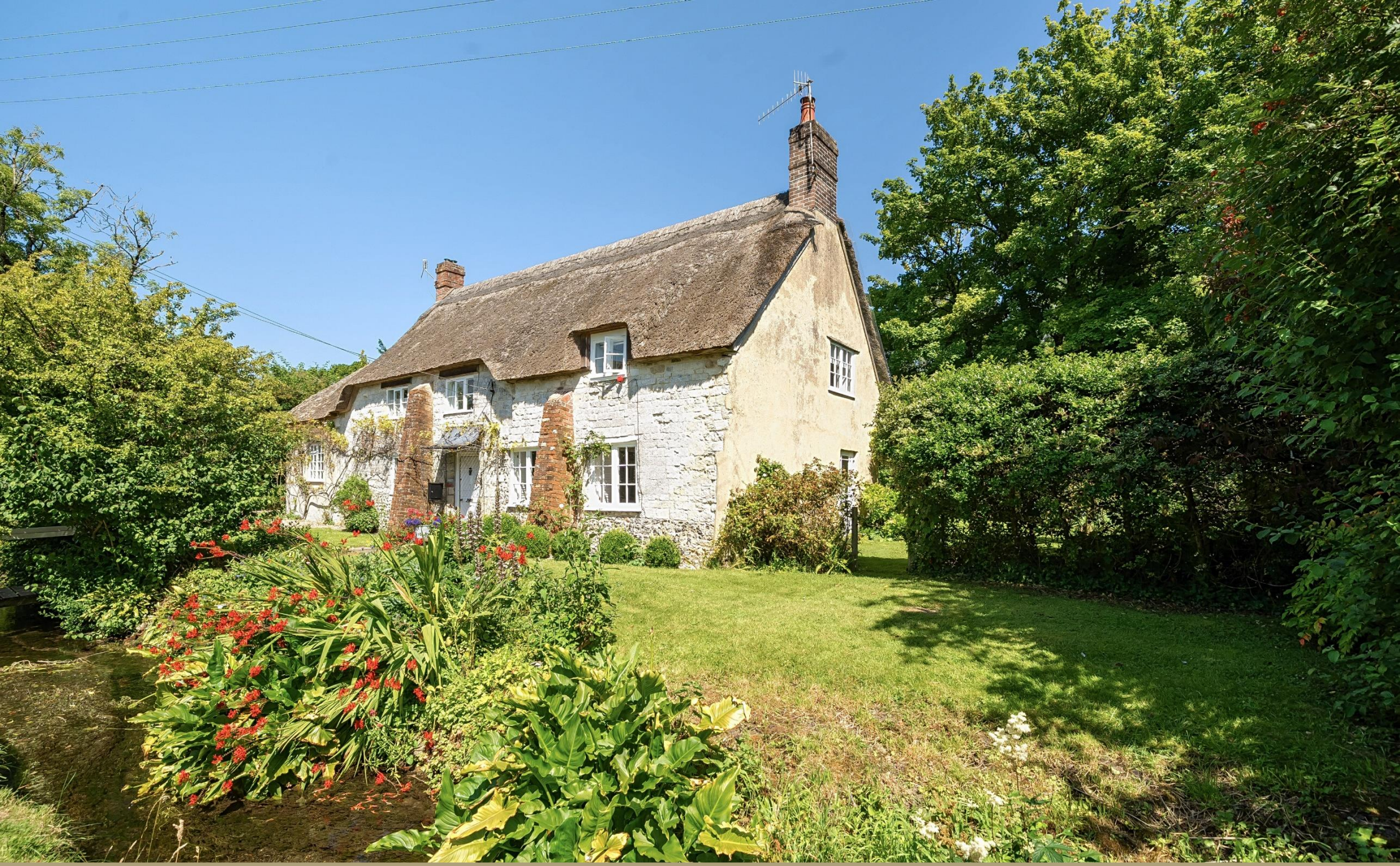
Lamperts Cottage Sydling St Nicholas