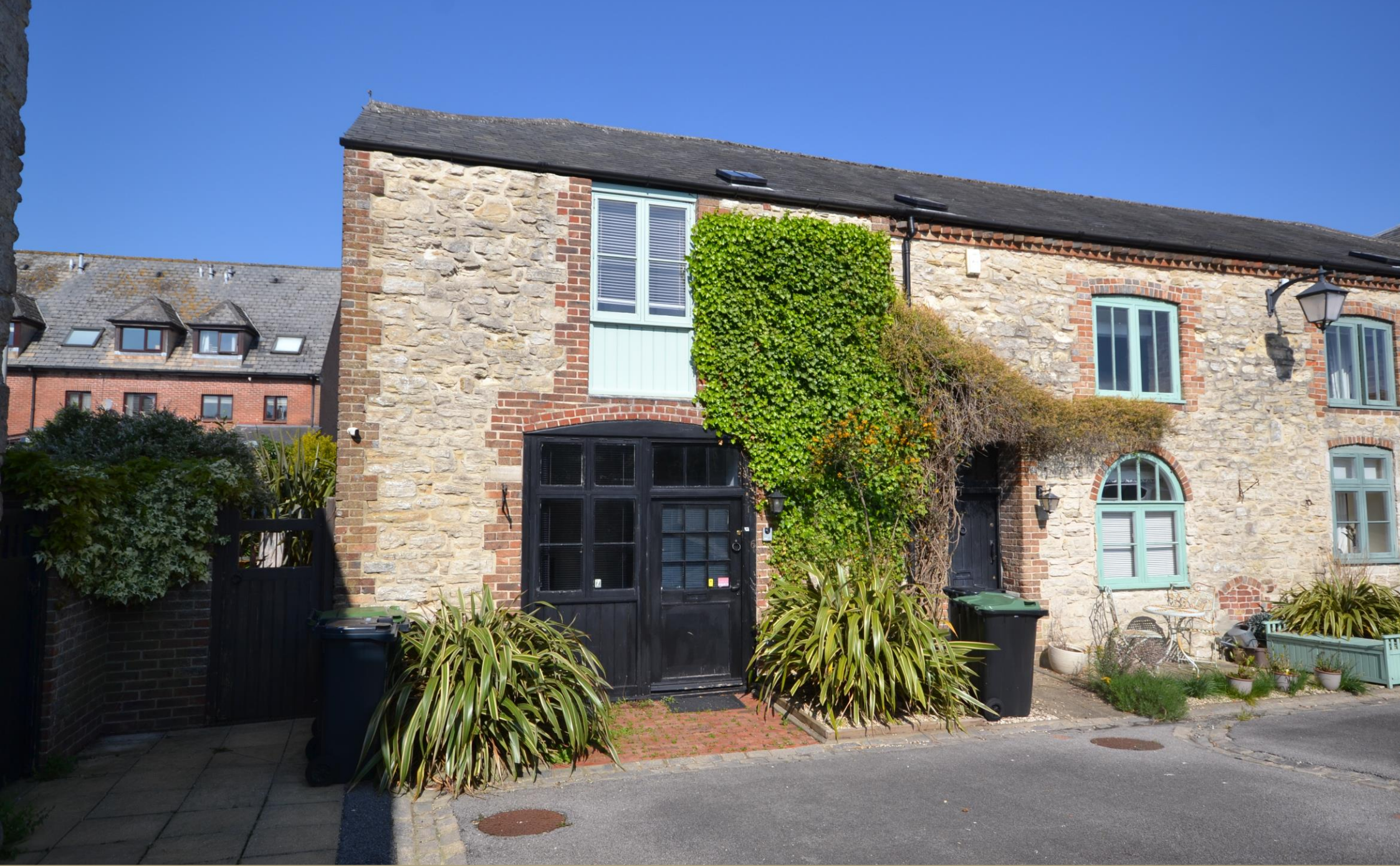
Fordington Dairy Dorchester