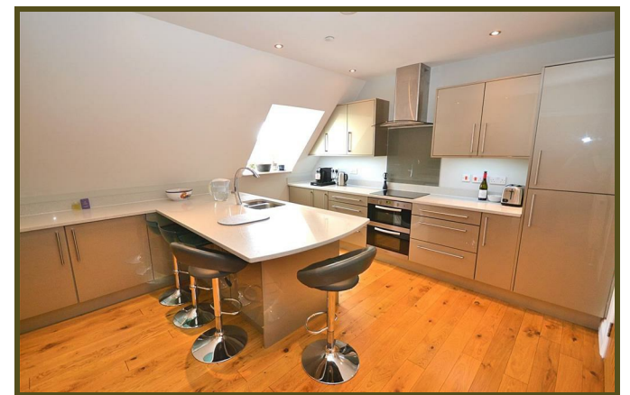
High East Street, Dorchester