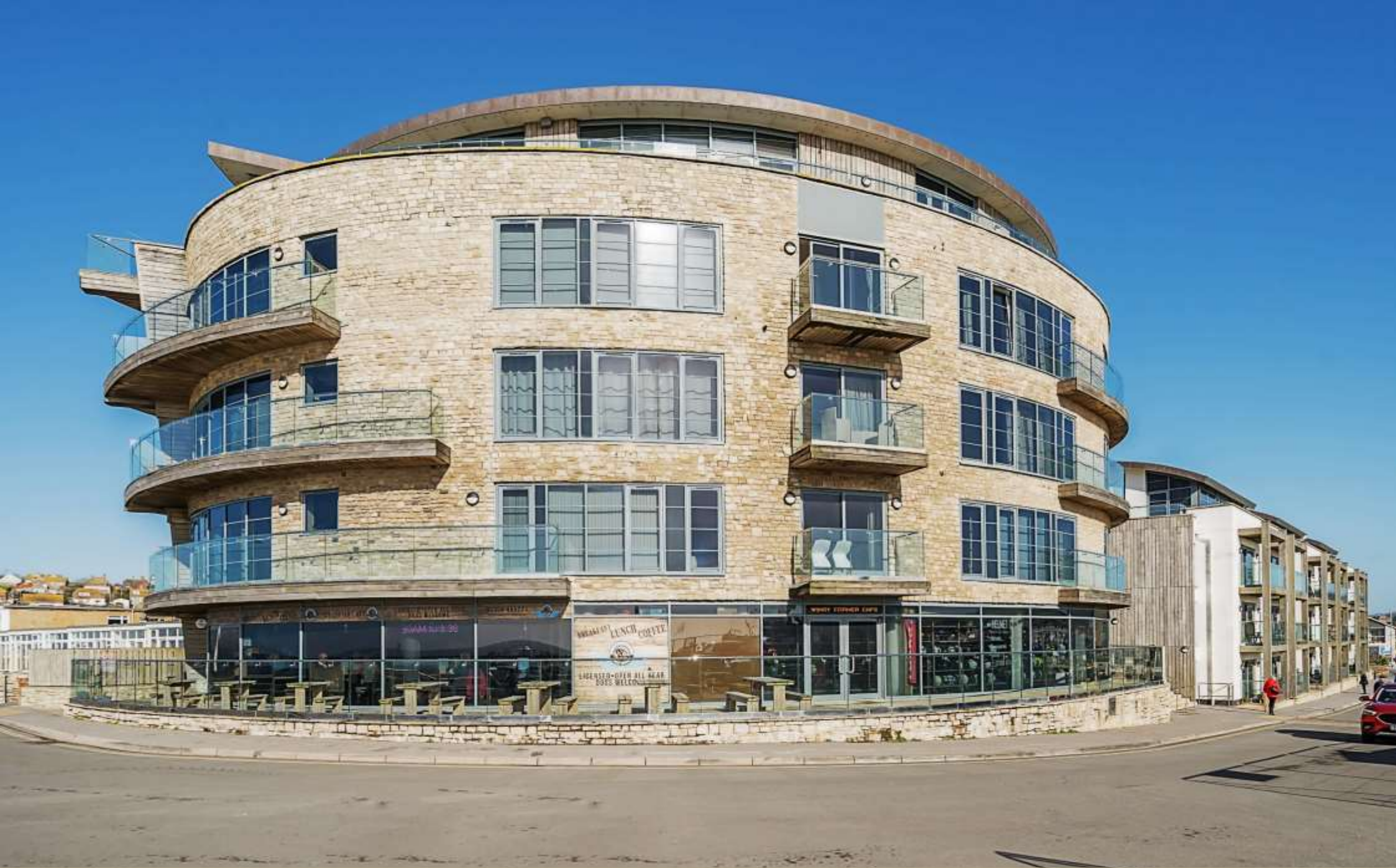
The Ellipse, Quay West Bridport