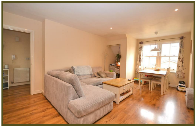
Hessary Place, Dorchester